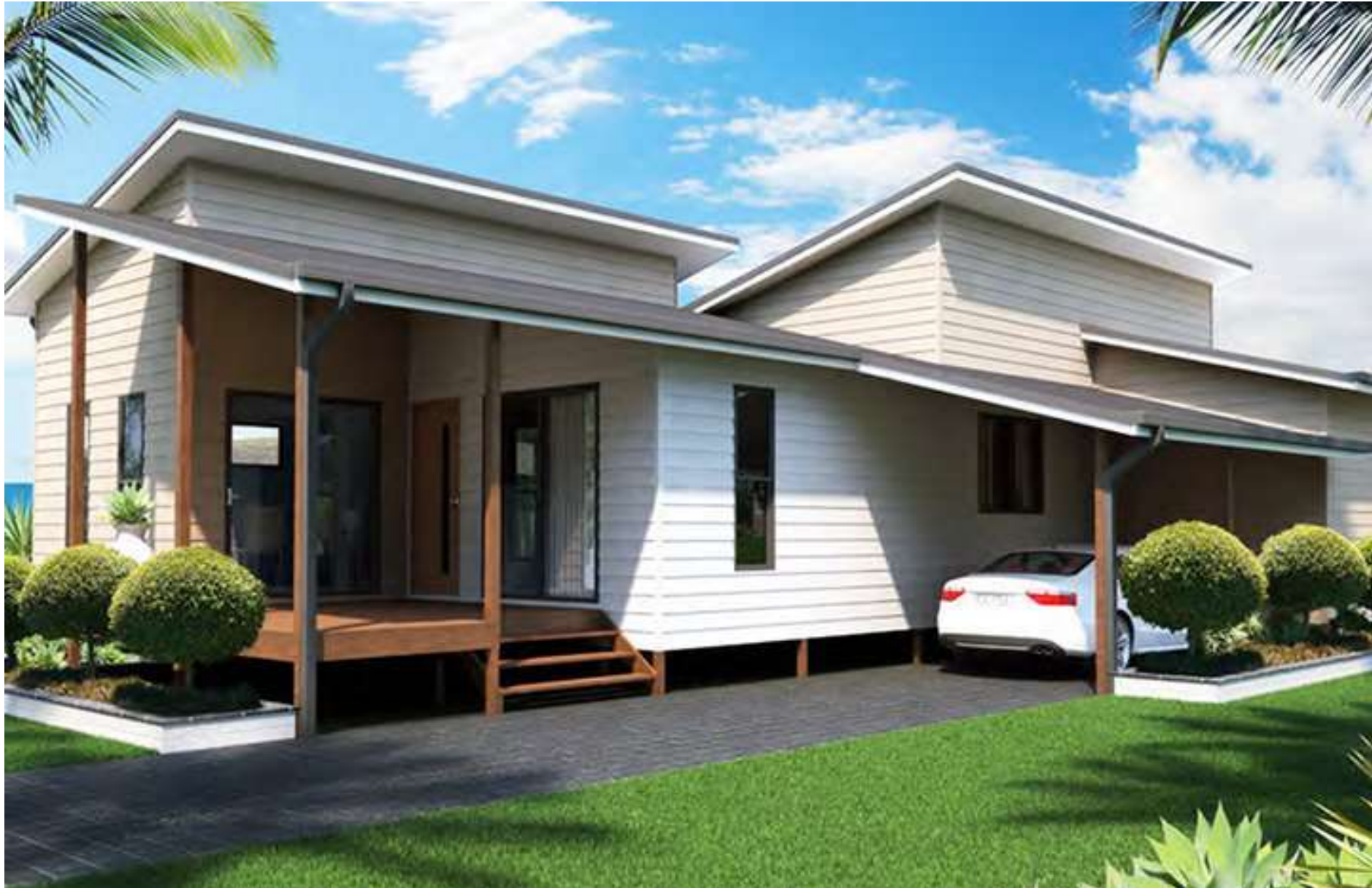
HOUSE DESIGN - Hunter Valley