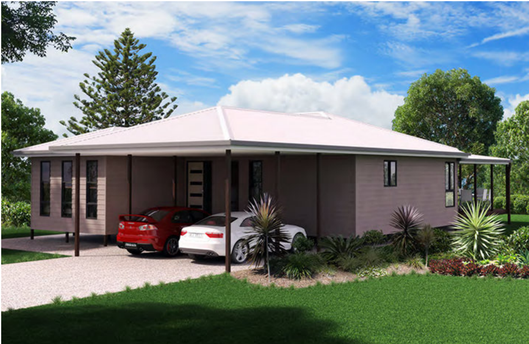
HOUSE DESIGN - Penrith