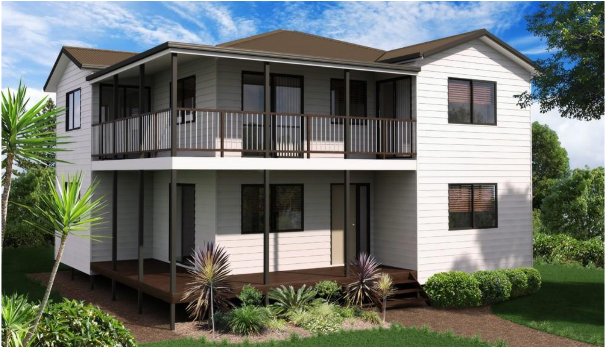
HOUSE DESIGN-SUNSHINE COAST