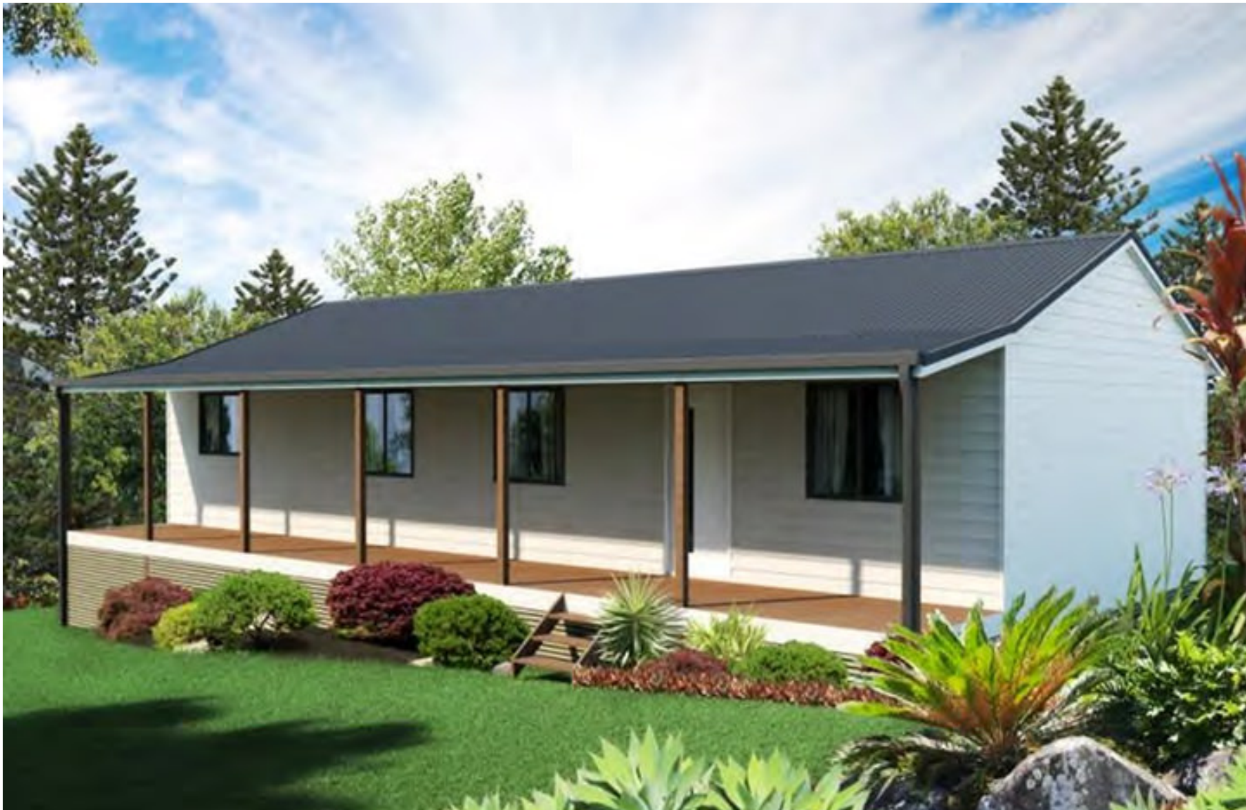
HOUSE DESIGN - Wodonga