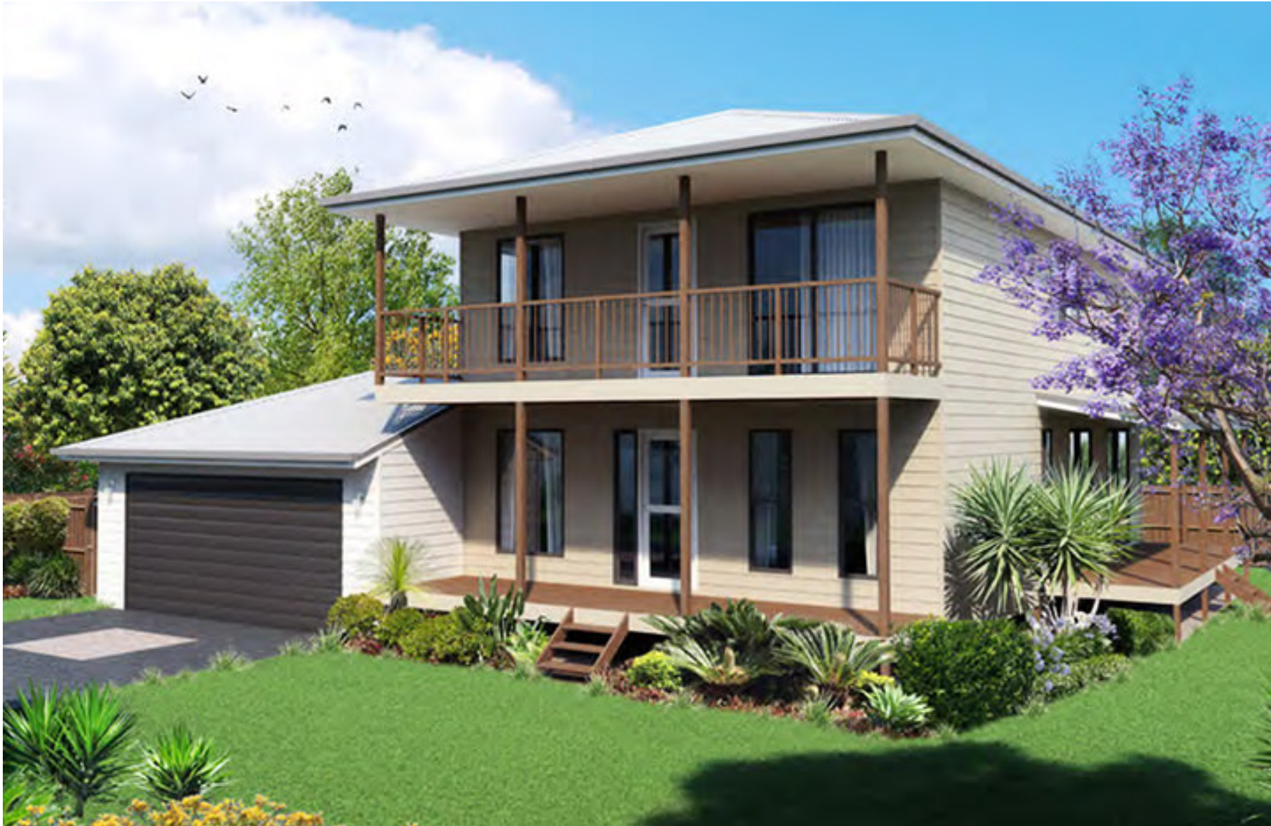
HOUSE DESIGN - Port Macquarie