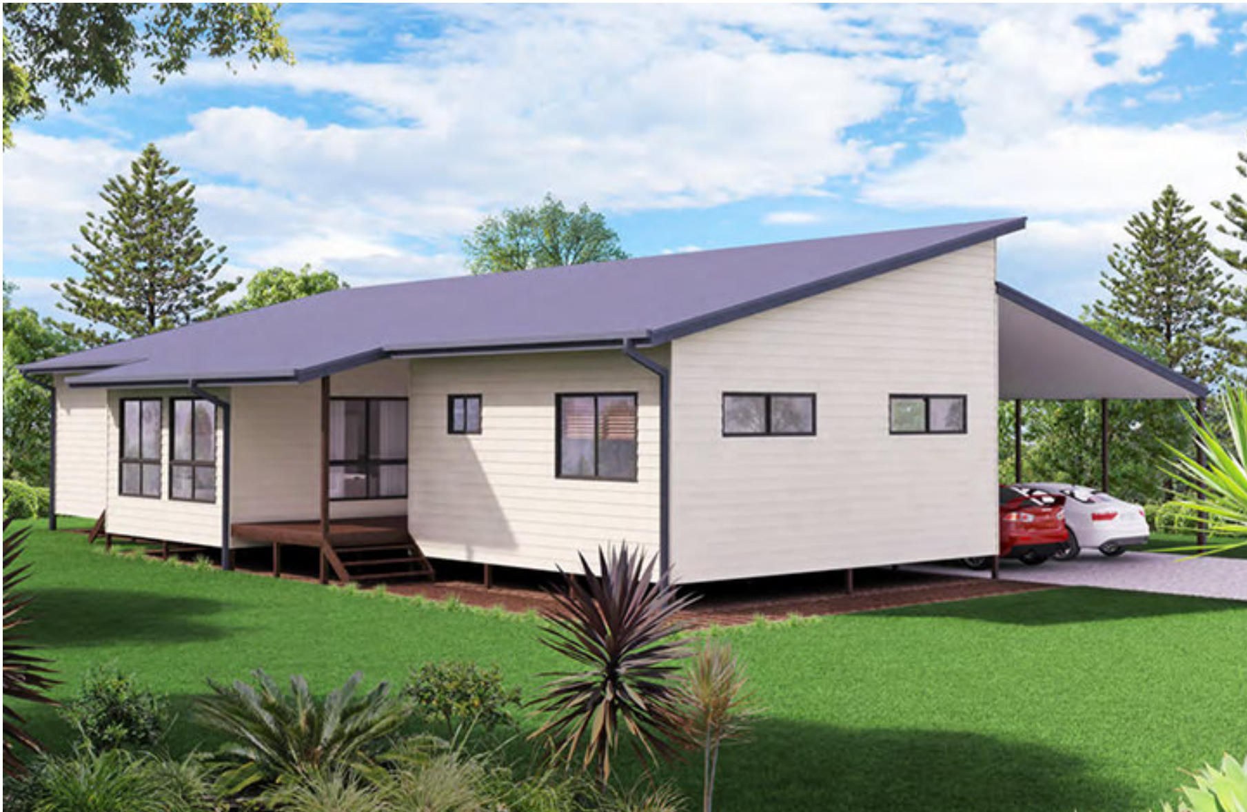
HOUSE DESIGN - Toowoomba